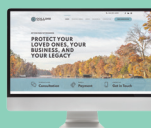
Personalized Website Design