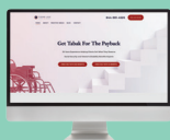
Custom Website Design